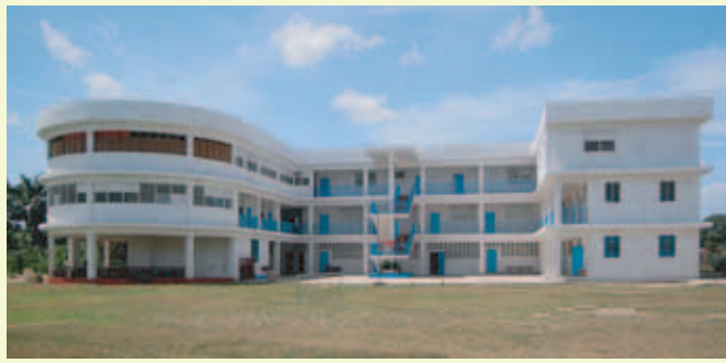
the completed building