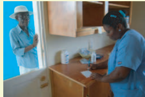
filling a prescription at the clinic pharmacy