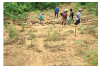
JP agricultural trainers layout erosion control.