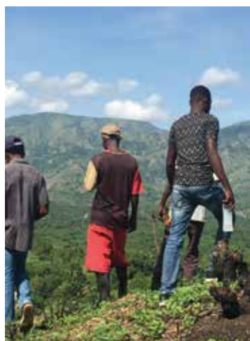
Farmers on a mountain farm, where poverty-driven farming is destroying the land and barely producing enough for subsistence.