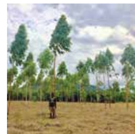
2-year old trees from JP's nursery reach for the sky.