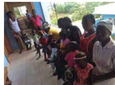
Patients waiting at the Clinic