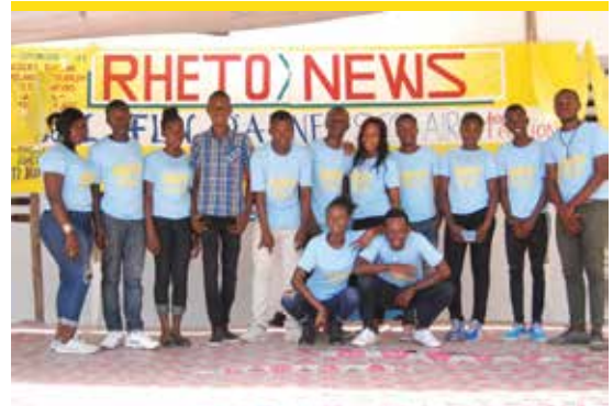
The 12th graders' end-of-year party with Rhetto News, a magazine they created.