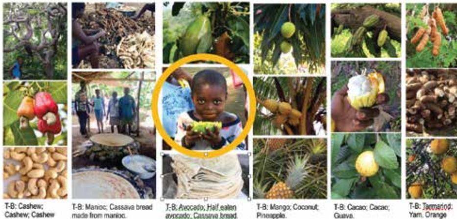
T-B: Cashew; Cashew, Cashew T-B: Manioc; Cassava bread made from manioc. T-B: Avocado; Half eaten avocado, Cassava bread T-B: Mango; Coconut, Pineapple. T-B: Cacao; Cacao; Guava. T-B: Taro/Manioc; Yam, Orange

The bruising yearlong drought of 2019 showed us just how fragile Haiti's food supply is. There is not enough to eat, families are hungry, and malnutrition is up. The situation has worsened due to steadily rising prices of imported food. Food is the ultimate economic asset. It is dependent on the land and farmers, and in turn has foundational value to the local economy. Farm to table should be a short reach. By increasing crop diversity and improving farming methods, the Food Development Program is increasing the reliability and resiliency of the food supply, enriching the diet, and increasing farm income.